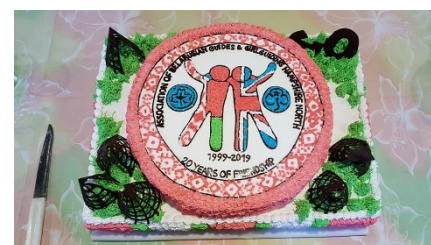
Selection of foods and more Russian